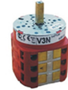
Single Speed Reversing Switch