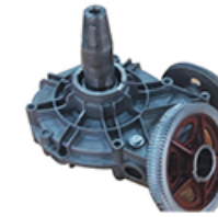
Quality Engineered Gearbox