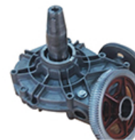
Quality Engineered Gearbox