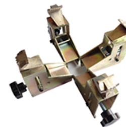
Optional motorcycle adaptors available