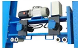
Optional 11,000Kg rolling scissor jack